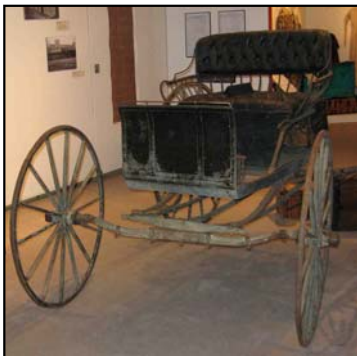
Skyline Farm’s Concord Buggy is on loan to the Saco Museum for its exhibition about Mary Bean, The Factory Girl, 1850s. The Saco Museum is located on Route 1, Saco, Maine.

NONPROFIT ORG. U.S. Postage PAID Yarmouth, ME Permit No. 310