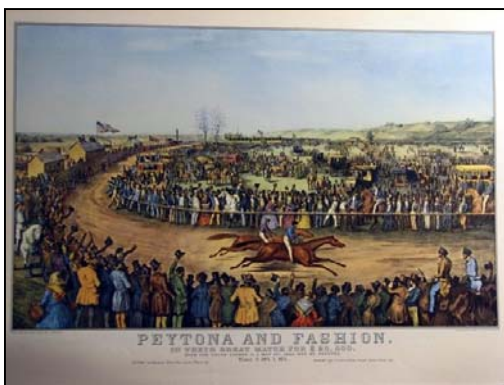
"Peytona and Fashion" Currier & Ives

Skyline Farm's new museum exhibit starting May 4 is titled "Summer Fair". The exhibit portrays a snapshot of a typical day at the fair in the early 1900's. Once, every Maine town proudly met at their local sandy oval to show off agricultural products, latest horse drawn vehicles and livestock. Winning blue ribbons and the bragging rights attached to them for the following year were the prizes of the day.